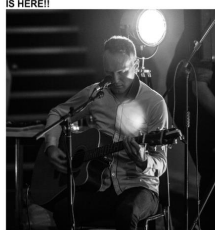
At David St School your kids can learn an instrument with a trained professional musician. Contact Carl for more info...