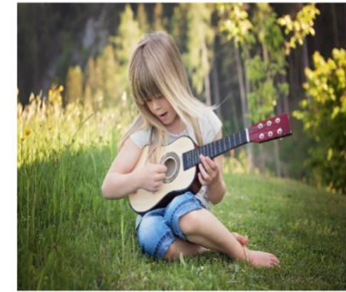
Get 3 FREE Lessons when you sign up for UKULELE or GUITAR this term with: