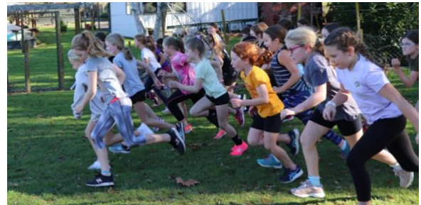
David Street School Gumbooted up last Friday.