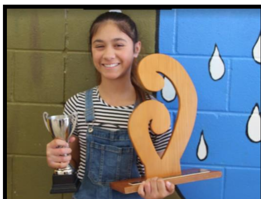
Visual Arts Cup & Te Whanau O Te Kura O Rawiri- Cair Hapi